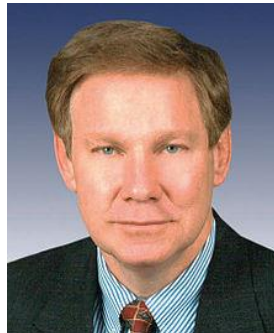
Former Congressman Tom Davis (R-VA)